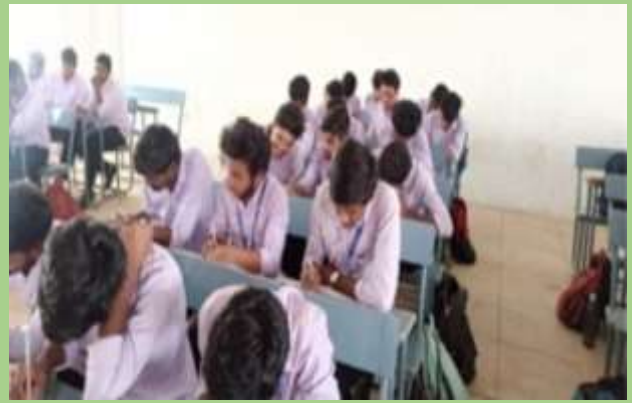
EAASY WRITING COMPITATION ON FREEDOM MOVEMENT