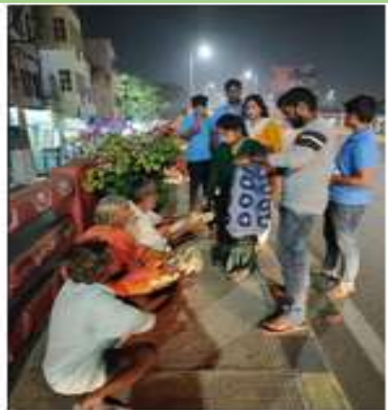
DISTRIBUTION OF BLANKETS ON ROADSIDE NEEDY